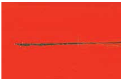
150 H SALT SPRAY TEST

If a higher resistance is required, use on F- 862 or F- 29.